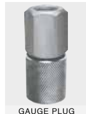
VAC TO 15,000 P.S.I.