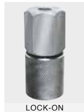
VAC TO 15,000 P.S.I.