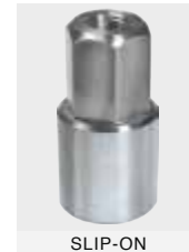
VAC TO 5,000 P.S.I.

The 1600 Series Gauge Plug and Probe System is offered in both Slip-On and Lock-On type and is used in taking pressures and samples as well as calibrating or verifying the accuracy of pressure gauges or meters.