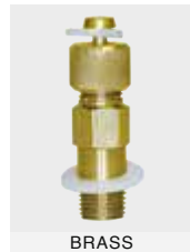
VAC TO 2,200 P.S.I.

Servicing the oil and gas industry worldwide for over 50 years, providing our customers with reliable pressure devices at competitive prices.