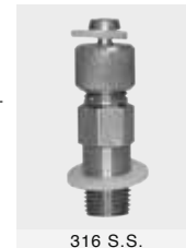
VAC TO 5,000 P.S.I.

The 1600 Series Mini Gauge Plug System is offered in Lock-On type and is used in taking pressures and samples as well as calibrating or testing the accuracy of fixed pressure gauges or meters.