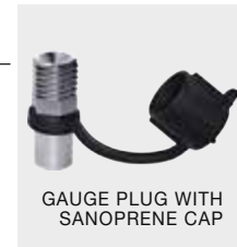
GAUGE PLUG WITH SANOPRENE CAP

Used in taking pressures and samples as well as calibrating or verifying the accuracy of fixed pressure gauges or meters.